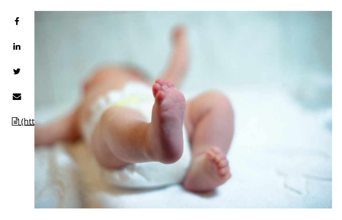
What happens to frozen embryos before they are able to become babies is still a matter that promises to undergo further judicial review.